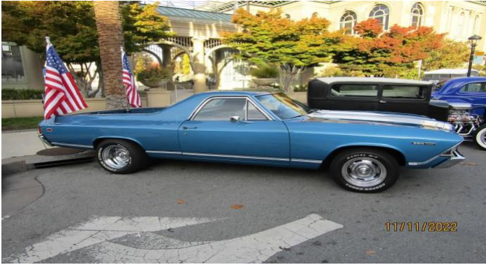
Classical car show participating vehicles are setting up at the Veterans Day 2022 celebration.

The Post 105 participates in various local and state veteran events for supportive services for veterans and their families. The following pictures illustrating examples of Post 105 supportive services for veterans and their families during an event in local communities. It's our post commitment for quality services supporting our veterans and their families – exemplifying by action throughout communities! (THANKS to all photographers for pics)