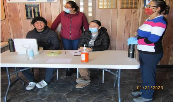
Sal's wife and family members preparing to sign-in people for the SOS breakfast event at our AL Post 105.

The Post 105 participates in various local and state veteran events for supportive services for veterans and their families. The following pictures illustrating examples of Post 105 supportive services for veterans and their families during an event in local communities. It's our post commitment for quality services supporting our veterans and their families – exemplifying by action throughout communities! (THANKS to all photographers for pics)