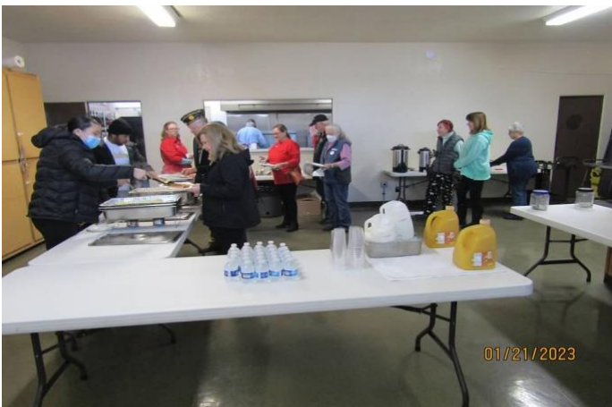
Volunteers serving SOS breakfast meals for veterans, and friends of veterans communities at AL Post 105 Family with Auxiliary Unit 105.