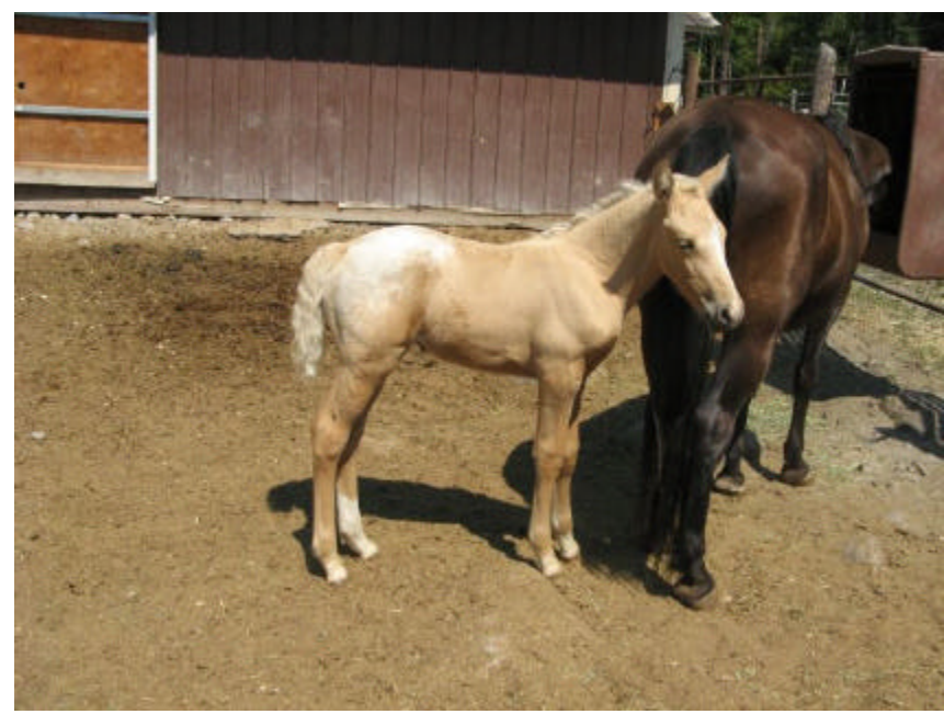
Gaited Neemepoo Shuffle Feathers, Manes Blue Eagle and Ulrich ancestry