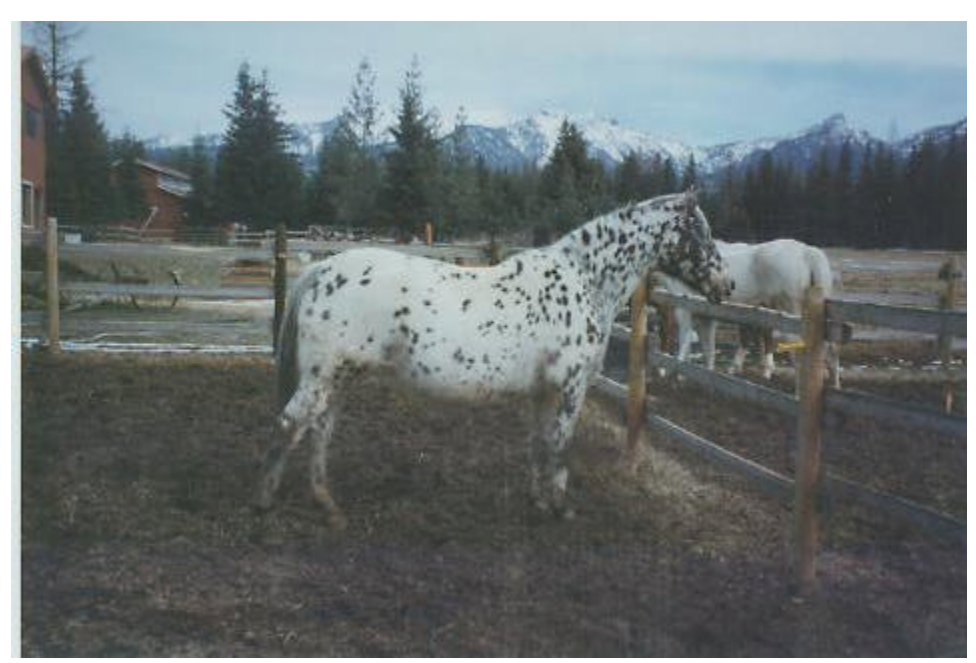
Ulrich Kitten III Verified Indian Shuffler