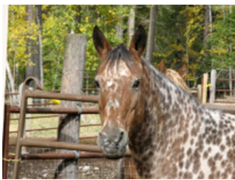
Ulrich Sierra Kitten

Many people think they want spirited horses but after ending up with bumps and bruises they change their minds and decide an Ulrich horse is what they really want. I believe in form and function. Horses with broad faces, square muzzles, straight profiles, stocky body builds, lob ears and almond shaped eyes, all translate to a calm, dependable temperament. The traits above all fit the Ulrich leopard beauties to a "T." You can have your pencil thin legged horses, with pin heads, tiny prick ears and more refined body bathing beauty conformation. I'll take the solid, stable, quiet temperament of an Ulrich horse every time.