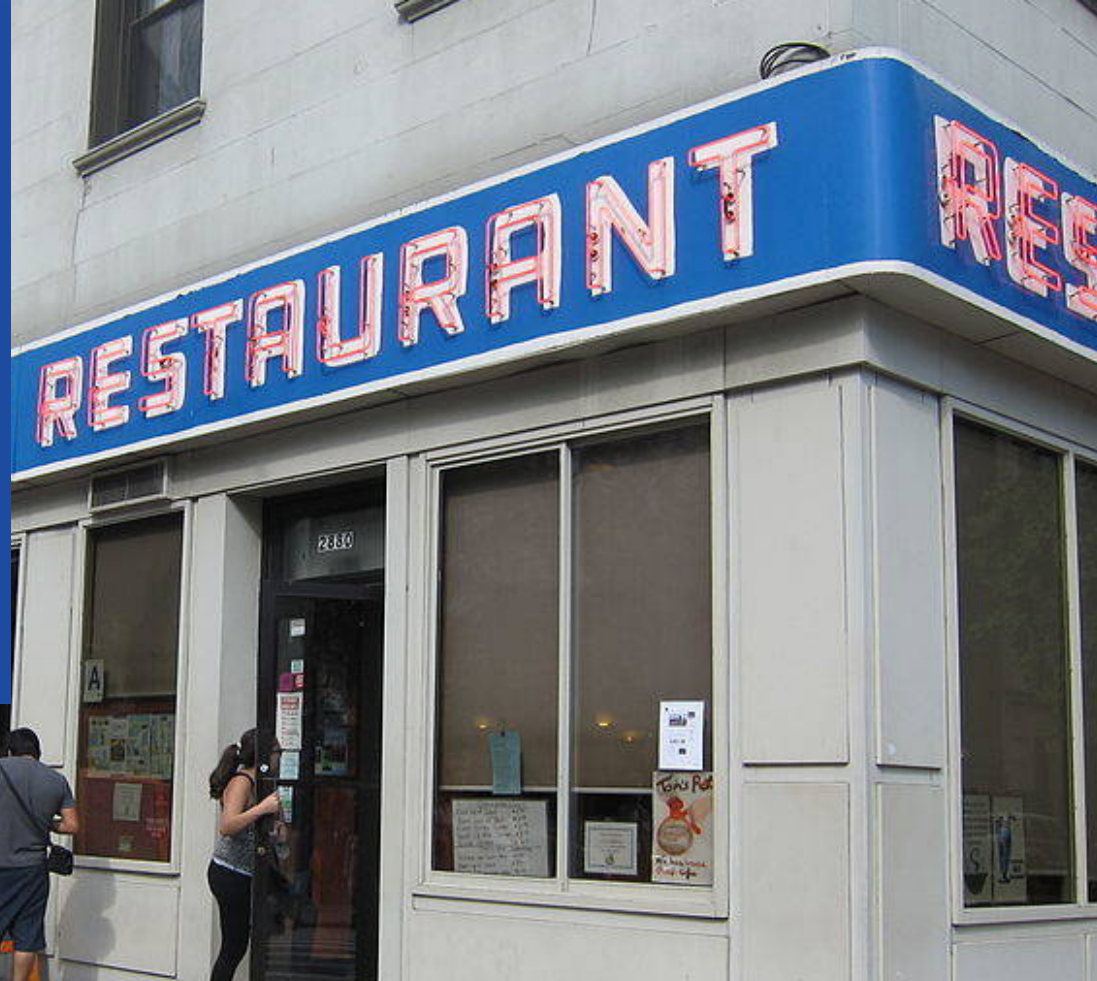
Seinfeld's Monk 's Cafe

Sit back and relish the scenic drive as we make our way from Newport, through New England , to the dazzling metropolis of New York City . Our first stop, as we head to Midtown , we'll stop at the famous Seinfeld Coffee Shop .