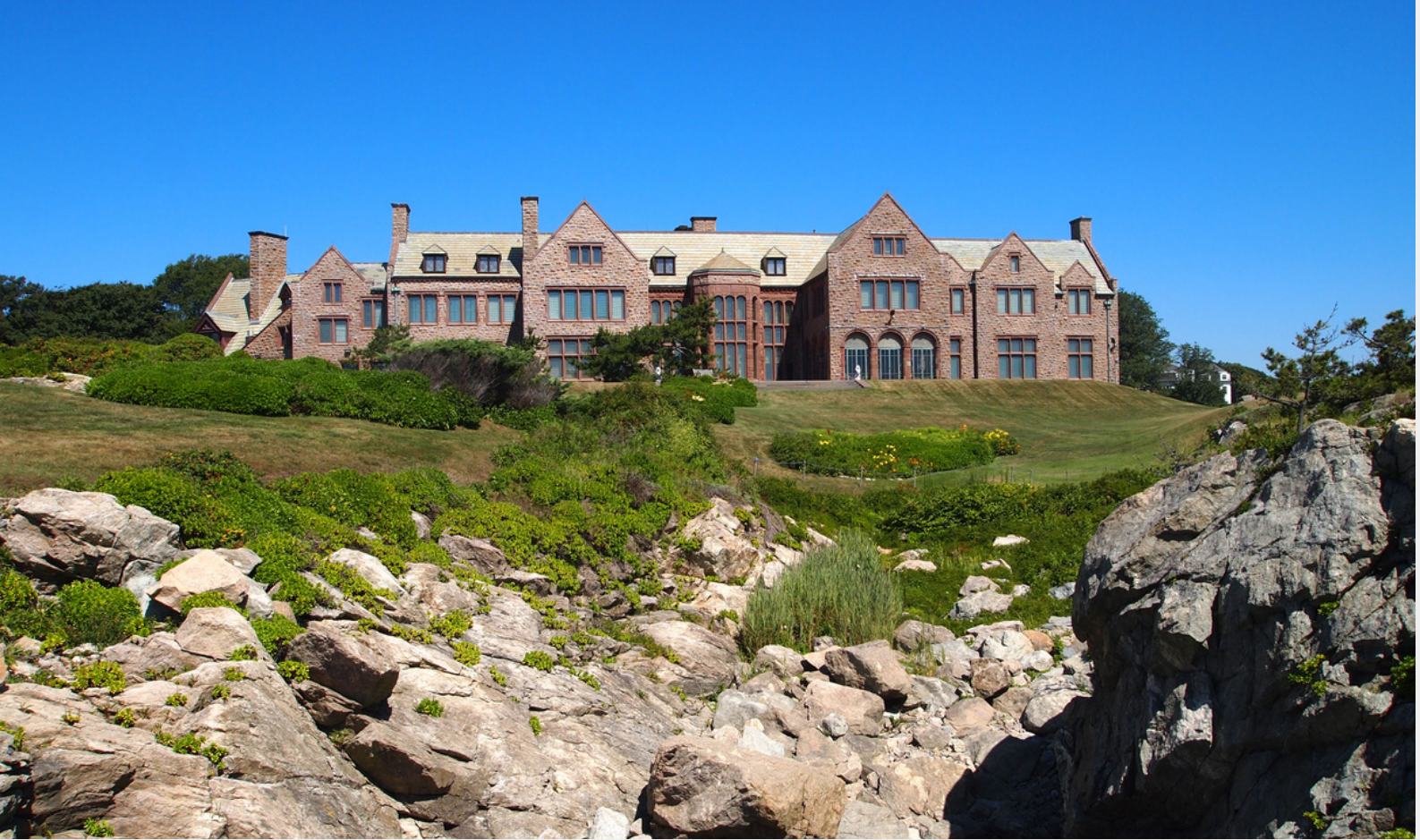
View from the Cliff Walk