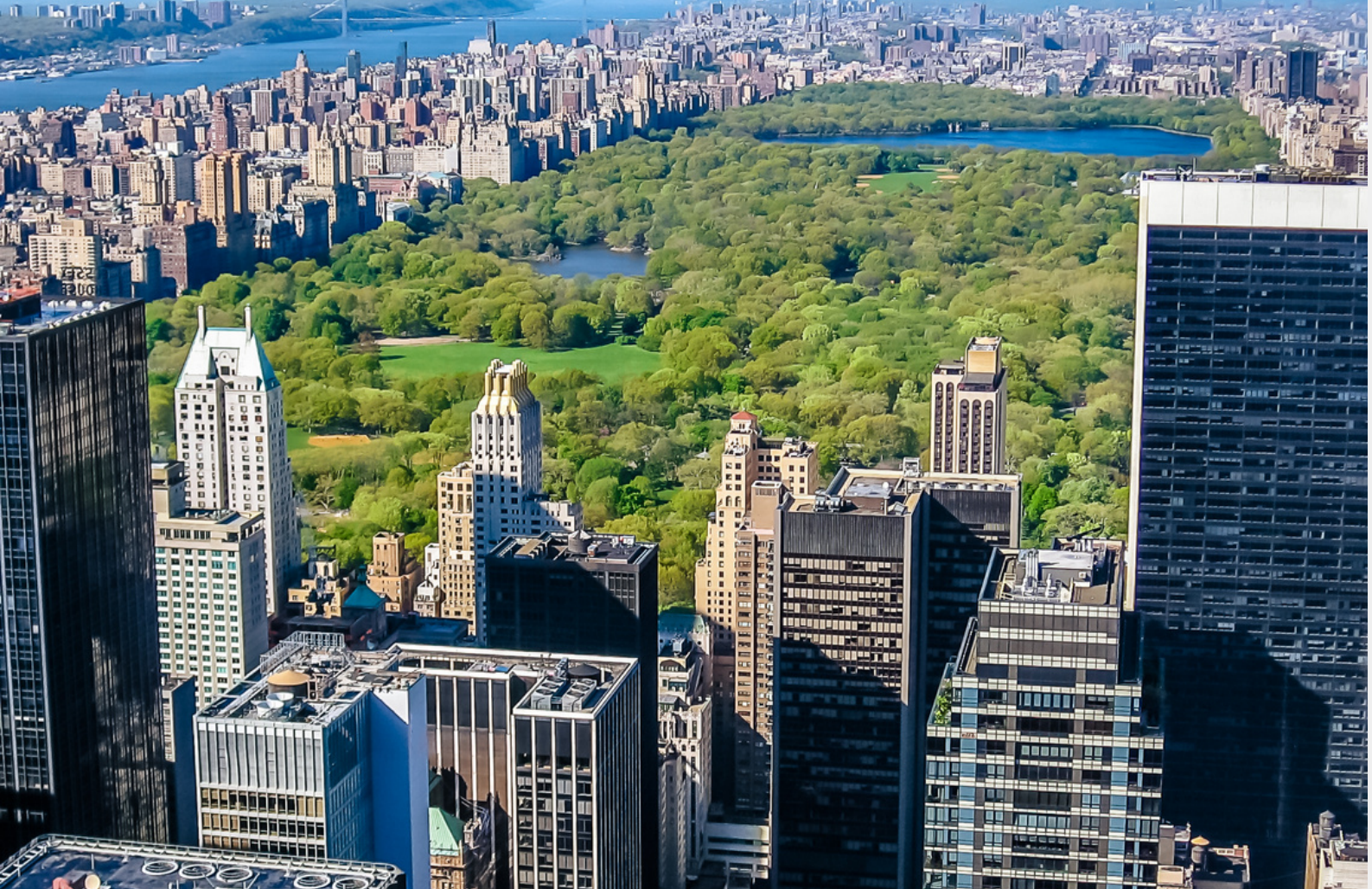
Central Park, New York City