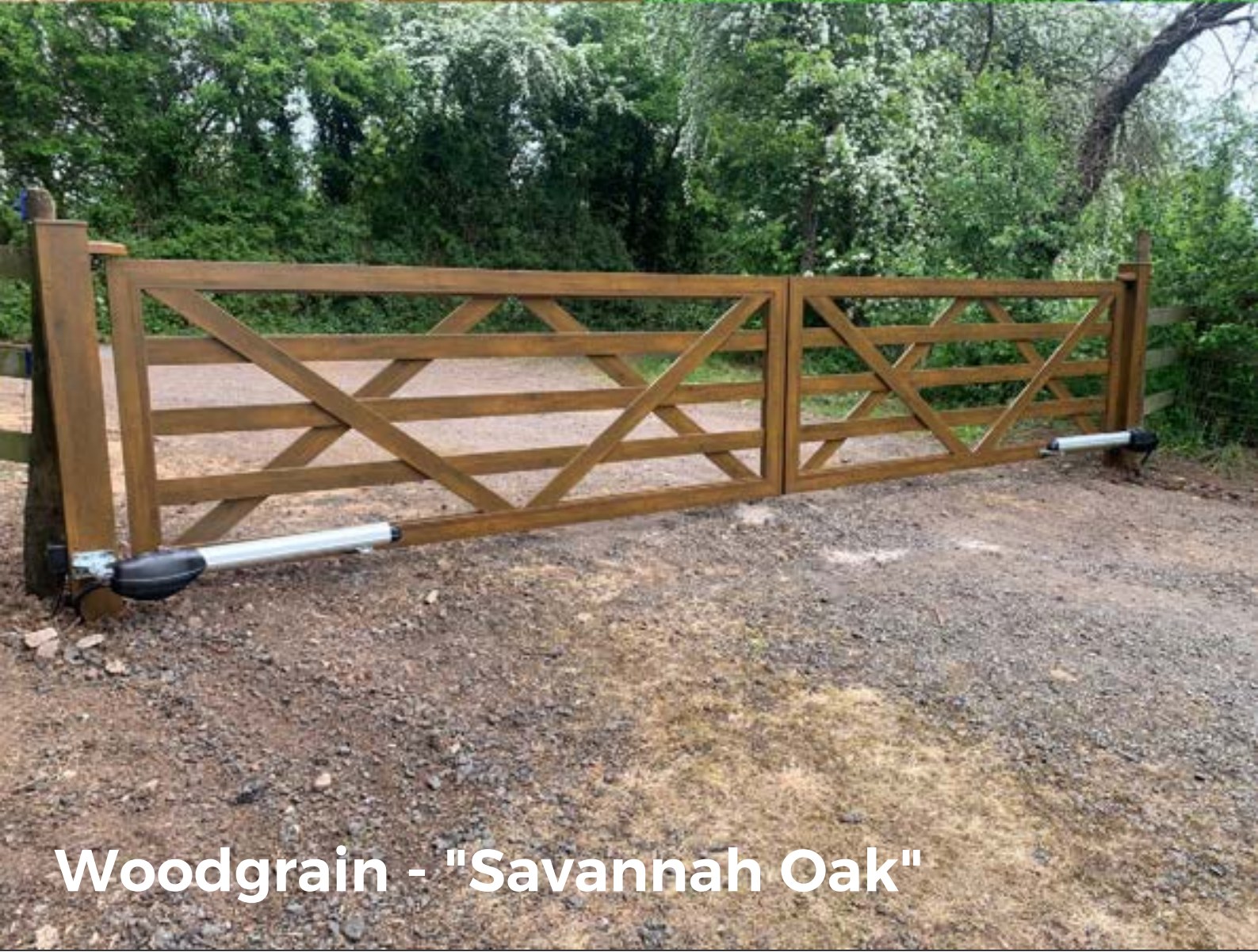
Woodgrain - "Savannah Oak"