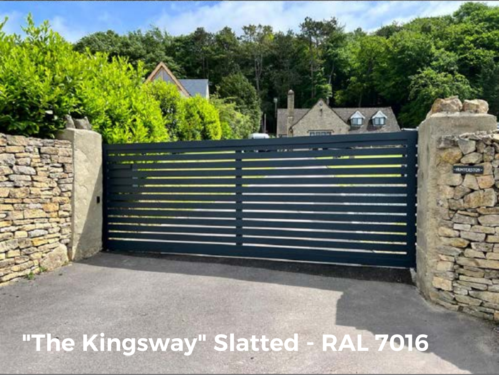
"The Kingsway" Slatted - RAL 7016