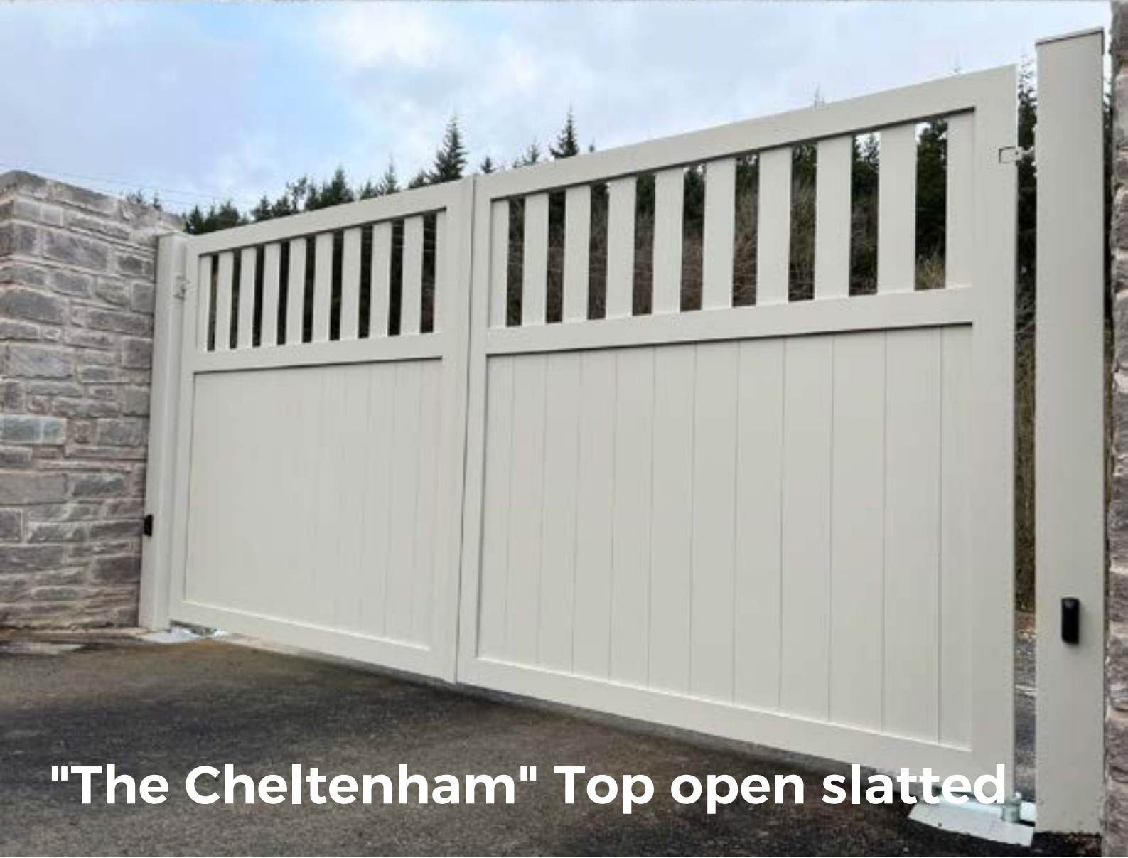
"The Cheltenham" Top open slatted