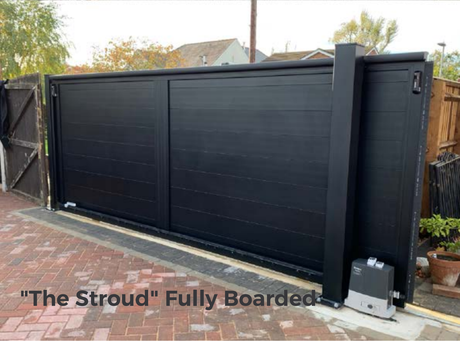
"The Stroud" Fully Boarded