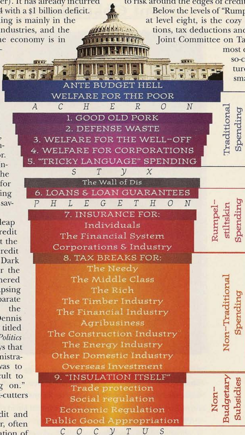
ILLUSTRATION BY JIM HOLLOWAY FOR THE NEW REPUBLIC

"traditional" spending subsidies for corporations up in level four.) The industries that benefit most from these tax expenditures are the financial, agribusiness, timber and, most of all, energy and construction industries. According to data collected by Douglas Koplou for the Alliance to Save Energy, energy tax subsidies now total about $6 billion per year (favoring fossil fuels continued on page 24