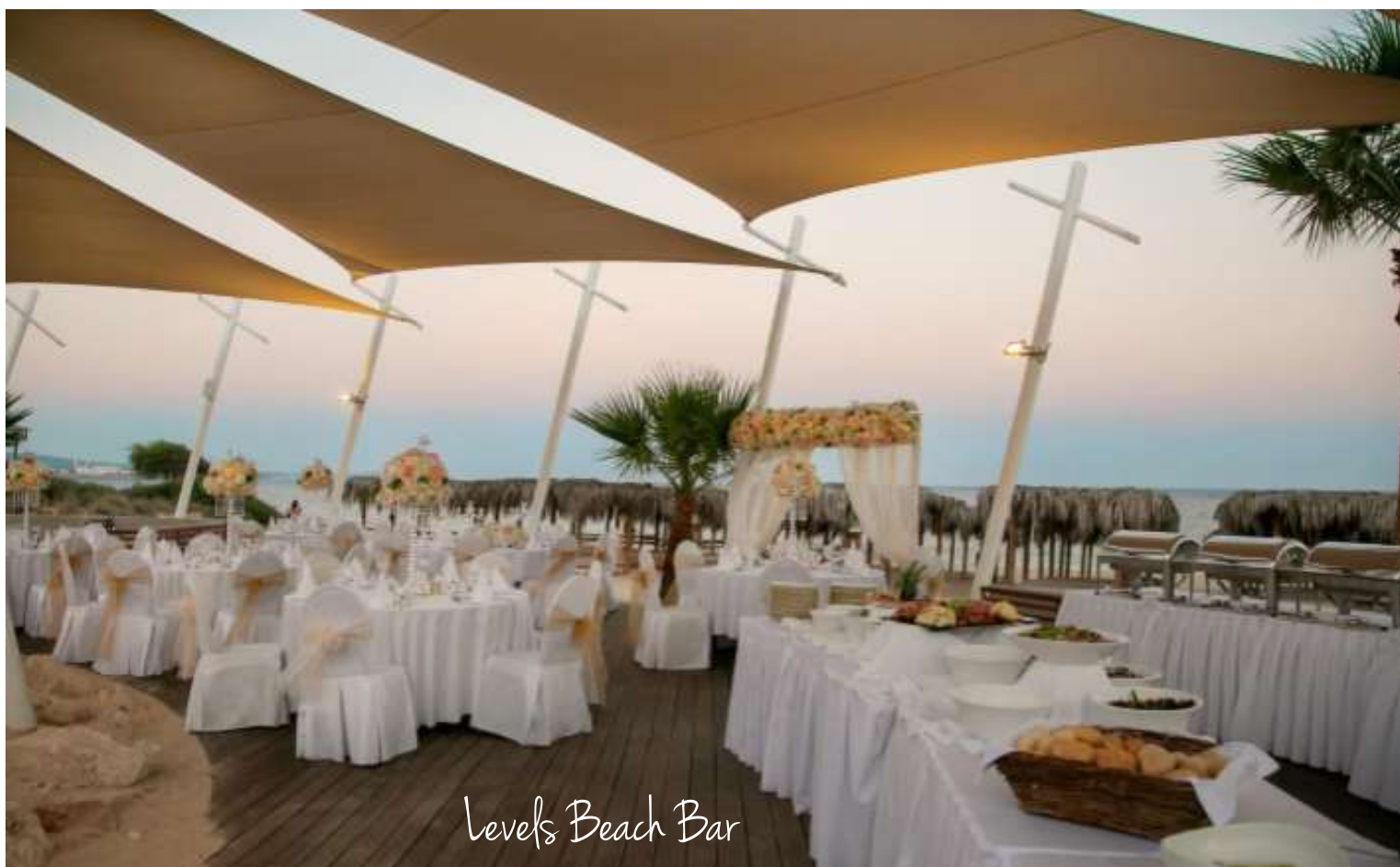
Levels Beach Bar