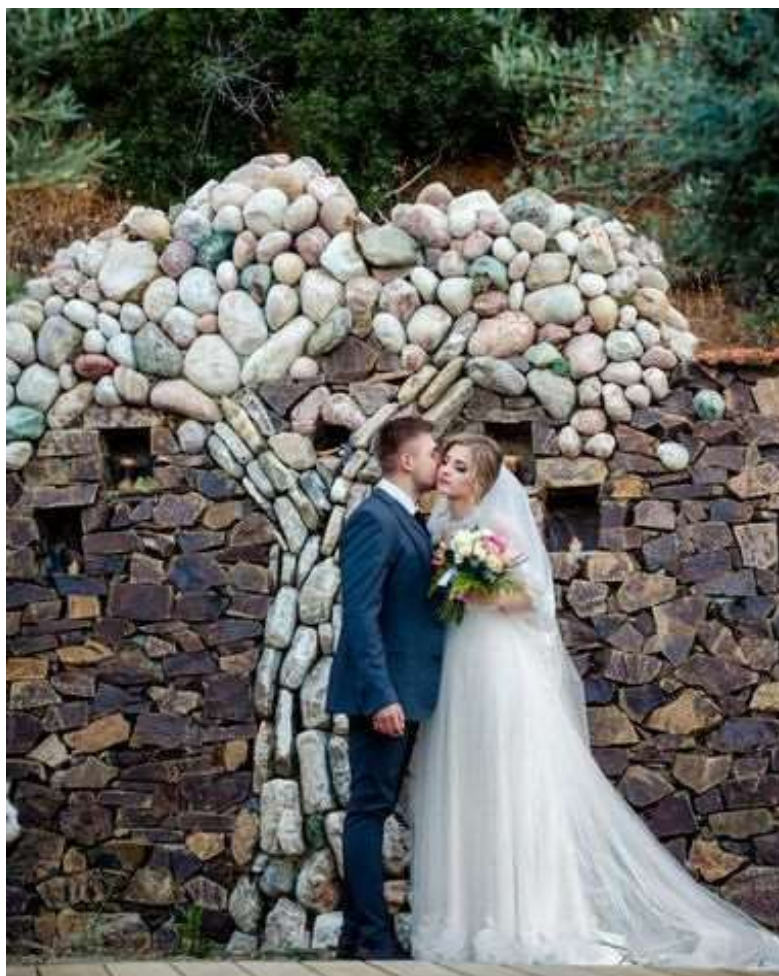
SPIRITUAL TREE OF MINERALS