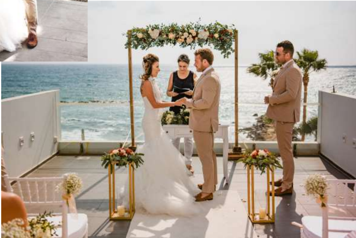
Illustrated with Rooftop Spa Ceremony & West Mosaics Restaurant Reception