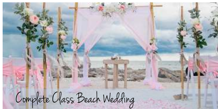
Complete Class Beach Wedding

The Cupule by the sea is a unique exclusive venue for couples seeking an exotic beach location in which to get married. Situated in Ayia Napa, directly on the beach and offering exclusive access to your own private beach, you will be treating your guests to breath-taking views of the Mediterranean sea. The Sandbank offers complete exclusivity available after 5 pm, your private ceremony will be held under any canopy of your choice. Reception drinks from Champagne or Signature Cocktails, served with Canapes, can be followed by Beach Banquet dinner or Barbeque. Class by the Sea, offers and organizes all the facilities to create the greatest party on the beach in Cyprus.