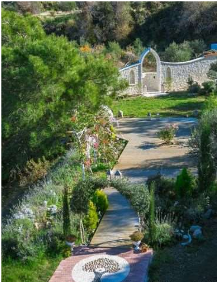
WHITE GOTHIC ARCH