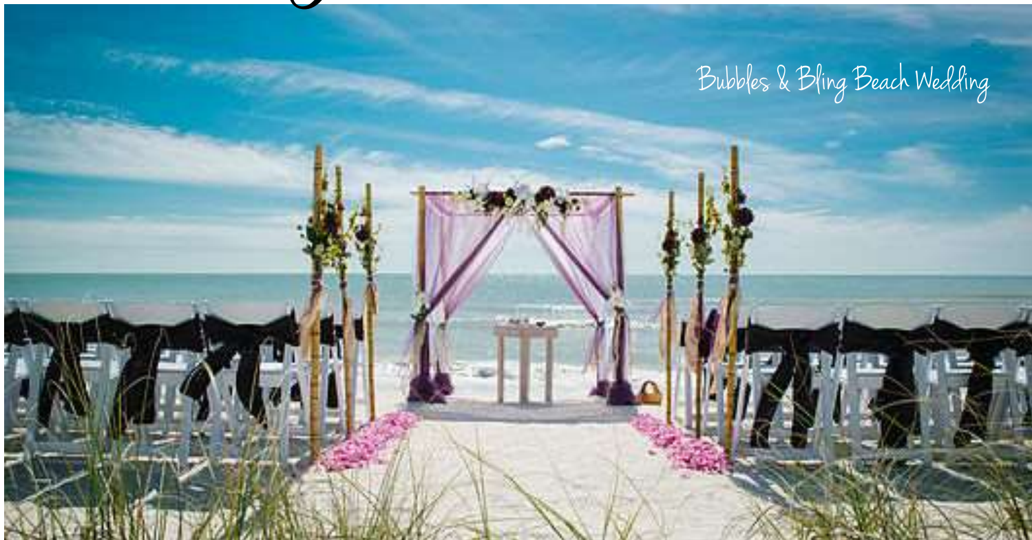
Bubbles & Bling Beach Wedding