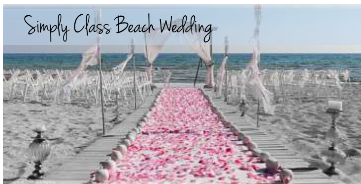
Simply Class Beach Wedding