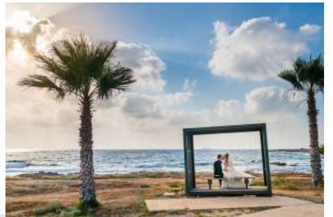
BEACH RESORT, PAPHOS