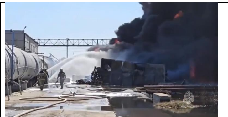
The train engulfed in flames near the world famous Trans-Siberian railway line