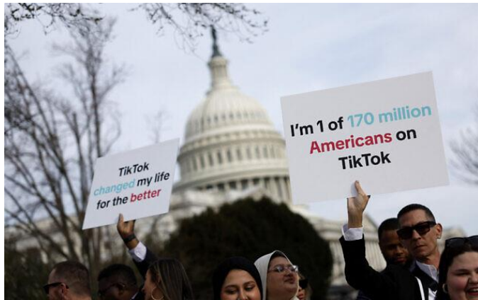
Participants hold signs in support of TikTok outside the US Capitol Building, in Washington, DC, on March 13, 2024.

“We believe the facts and the law are clearly on our side, and we will ultimately prevail,” the company said in a statement. “The fact is, we have invested billions of dollars to keep US data safe and our platform free from outside influence and manipulation. This ban would devastate seven million businesses and silence 170 million Americans.”