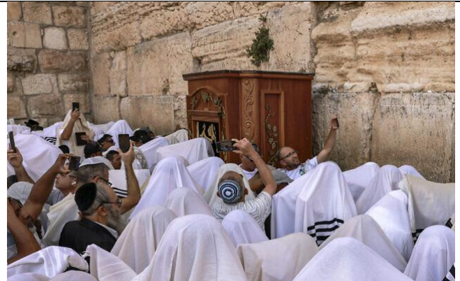
A group of Jewish worshipers recite the Passover priestly blessing at the Western Wall in the Old City of Jerusalem on April 25, 2024.