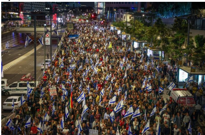
Demonstrators protest calling for the release of Israeli hostages held in the Gaza Strip and against the current Israeli government outside Hakiryia Base in Tel Aviv, April 20, 2024.

The deal on the table that would bring a ceasefire to Gaza simply with the release of women, wounded, elderly, and sick hostages is ready to go, a senior administration official said, and Hamas has rejected that.