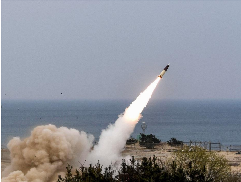
The US-made missiles can be equipped with a 500lb warhead

But "we did not announce this at the onset in order to maintain operational security for Ukraine at their request," Patel said, adding that the "missiles arrived in Ukraine this month."