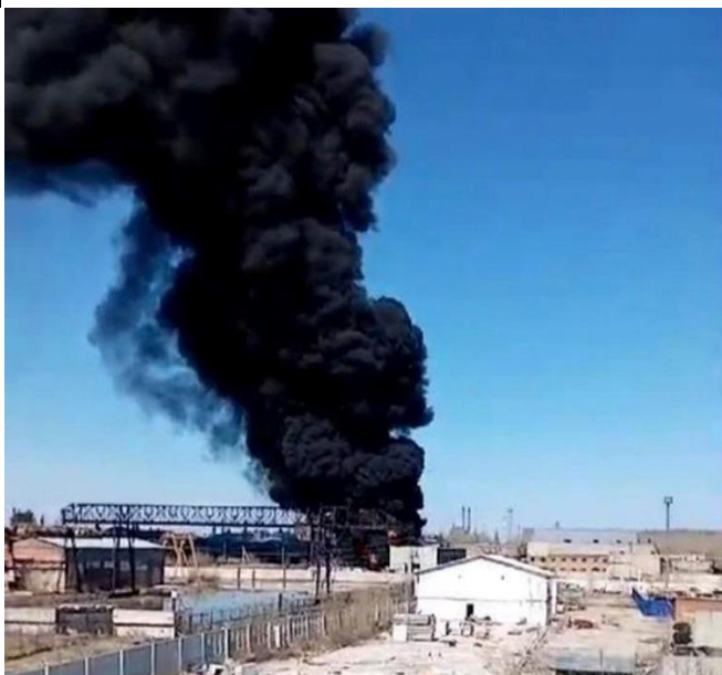
Three wagons containing a combined 89 tonnes of oil were set ablaze