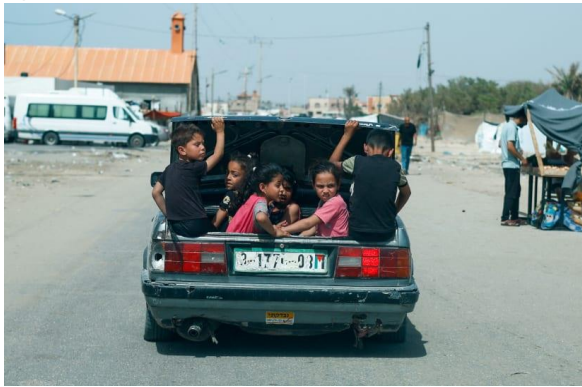
Children sit in a car trunk, amid the ongoing conflict between Israel and Hamas, in Rafah, in the southern Gaza Strip, April 24, 2024.

By YONAH JEREMY BOB APRIL 25, 2024 16:04 Updated: APRIL 25, 2024 21:01