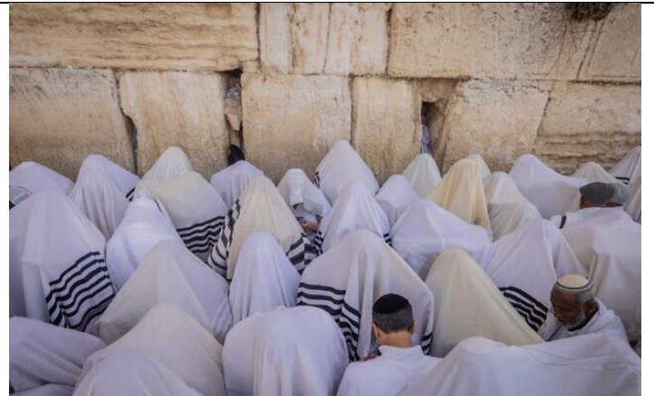
Thousands of Jewish worshippers gather at the Western Wall for the Passover priestly blessing in Jerusalem's Old City on April 25, 2024.

Thousands of Jewish worshipers at the Western Wall recited a special prayer Thursday for the return of hostages held by Hamas, during the traditional priestly blessing ceremony held at the site on Passover.