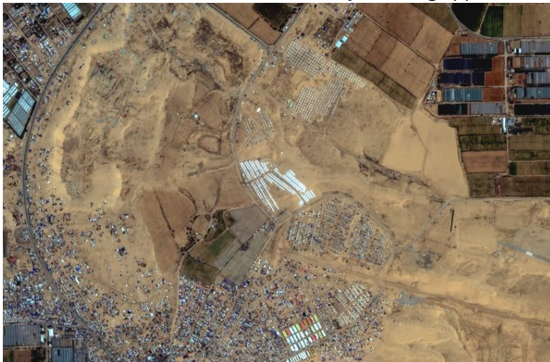
A satellite image shows an overview of a tent camp settlement near Rafah, amid the ongoing conflict between Israel and the Palestinian Islamist group Hamas, in the southern Gaza Strip, April 23, 2024.

Further, the IDF's push to start the Rafah invasion has gotten more serious with some increasing frustration with the war cabinet for not yet having approved the operation.