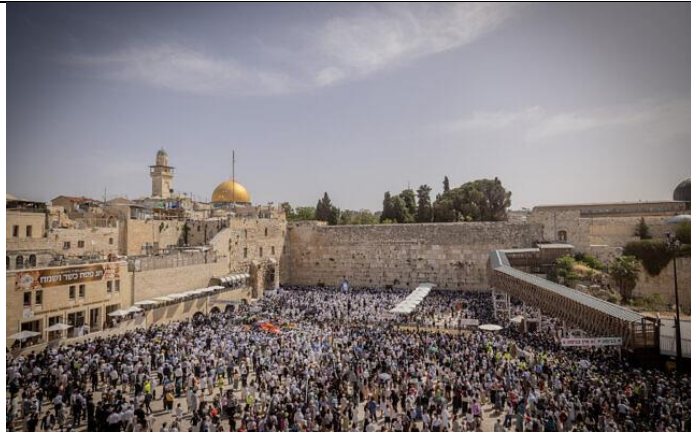
Thousands of Jewish worshipers attend the priestly blessing ceremony at the Western Wall in Jerusalem's Old City on April 25, 2024.