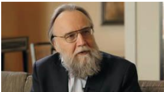
Aleksandr Dugin.

The Western world has abandoned classical liberalism in favor of a new version defined by the rule of minorities and woke-ism, the Russian philosopher explained