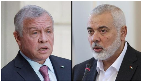
Jordan's King Abdullah II, Ismail Haniyeh

Senior Hamas officials announced Monday that they will move to Jordan, which has expelled them in the past, if they are forced to leave Qatar. The kingdom issued a statement shortly after saying any Palestinian who requests to move to Jordan will be required to prove they have severed ties with the terrorist group.