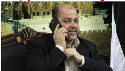
Mousa Abu Marzouk

Meanwhile, Qatari channel Al-Jazeera has geared up to criticize Hamas' leadership and sharply condemn the organization's opponents.