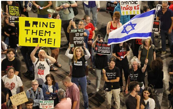
Relatives and supporters of hostages held by Hamas in Gaza since October 7, hold placards and wave Israeli flags during a demonstration calling for their release, Tel Aviv, April 27, 2024.