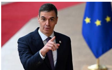
Spain's Prime Minister Pedro Sanchez speaks to the press before a European Council summit at the EU headquarters in Brussels on March 21, 2024.

Borrell's comments come amid a series of moves from European countries seeking to recognize Palestinian statehood. Earlier in April, Spanish Prime Minister Pedro Sanchez said his country would recognize Palestinian statehood by July. Sanchez added that that he believed there would soon be a "critical mass" within the European Union to push several member states to adopt the same position, according to state news agency EFE.