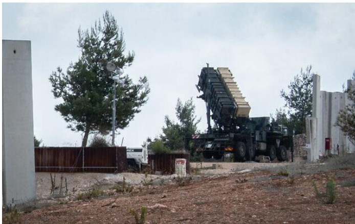
File: A Patriot battery is seen stationed in northern Israel, August 2, 2018.

The Israeli Air Force is set to bid farewell to its aging Patriot missile defense systems in the coming months, replacing the batteries with more advanced air defenses, the military said Tuesday.