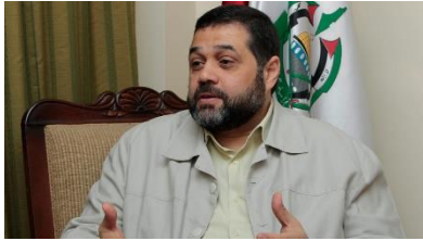
Osama Hamdan

"Many Jordanian Palestinians participate in demonstrations in support of Gaza residents, against Israel, every night," said senior Hamas official Osama Hamdan, who serves as Haniyeh's second-in-command.