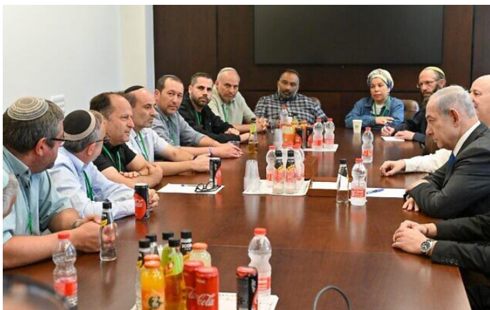
Netanyahu, right, meets with members of the Gvura Forum and Tikva Forum in Jerusalem on April 30, 2024.

The meeting came before Netanyahu was slated to talk with far-right National Security Minister Itamar Ben Gvir, who is also opposed to stopping the war and making concessions to Hamas. Finance Minister Bezalel Smotrich, who has threatened to withdraw from the coalition if such a deal is signed, skipped Tuesday’s cabinet meeting in order to huddle with his Religious Zionism faction amid the disagreement.