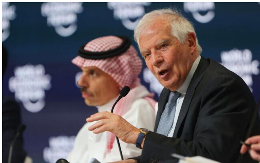
Saudi Foreign Minister Prince Faisal bin Farhan (L) and EU foreign policy chief Josep Borrell attend the World Economic Forum Special Meeting in Riyadh on April 28, 2024.

By Agencies and Tol Staff Today, 6:08 am