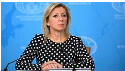
Russian Foreign Ministry's spokesperson Maria Zakharova.

US calls for Russia to hold talks on ending the Ukraine conflict seem detached from reality and ignore Moscow's previous attempts to reach a settlement, Foreign Ministry spokeswoman Maria Zakharova has said.