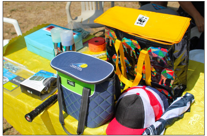
Hats and visors and other accessories with embroidered club logos are available for purchase.