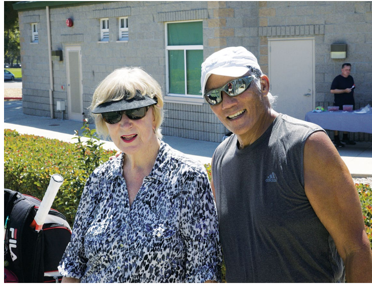
Tennis Day participants and new members enjoy a doubles mixer, a potluck lunch, and a raffle