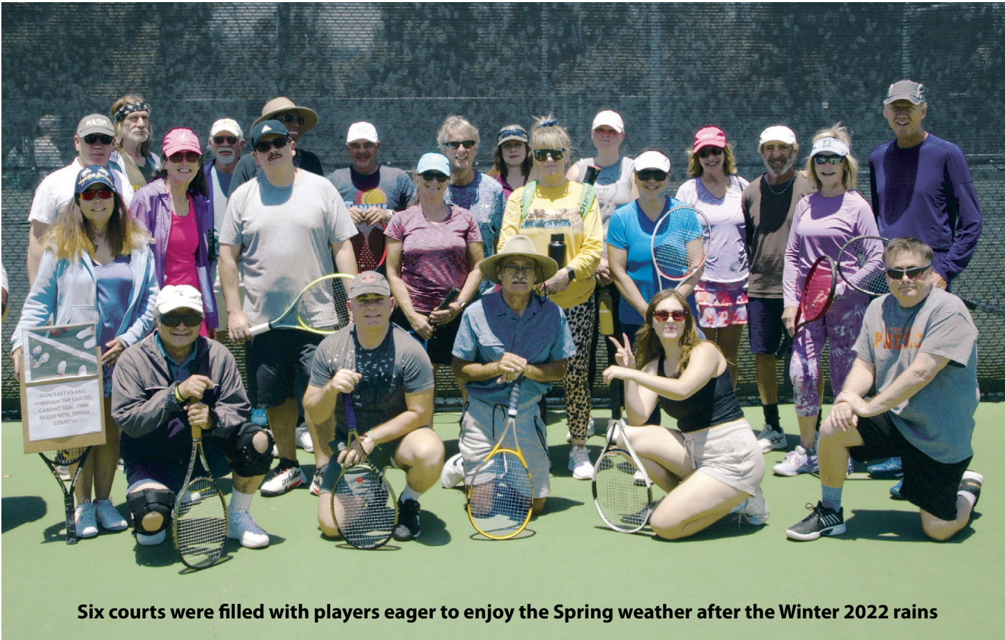
Six courts were filled with players eager to enjoy the Spring weather after the Winter 2022 rains