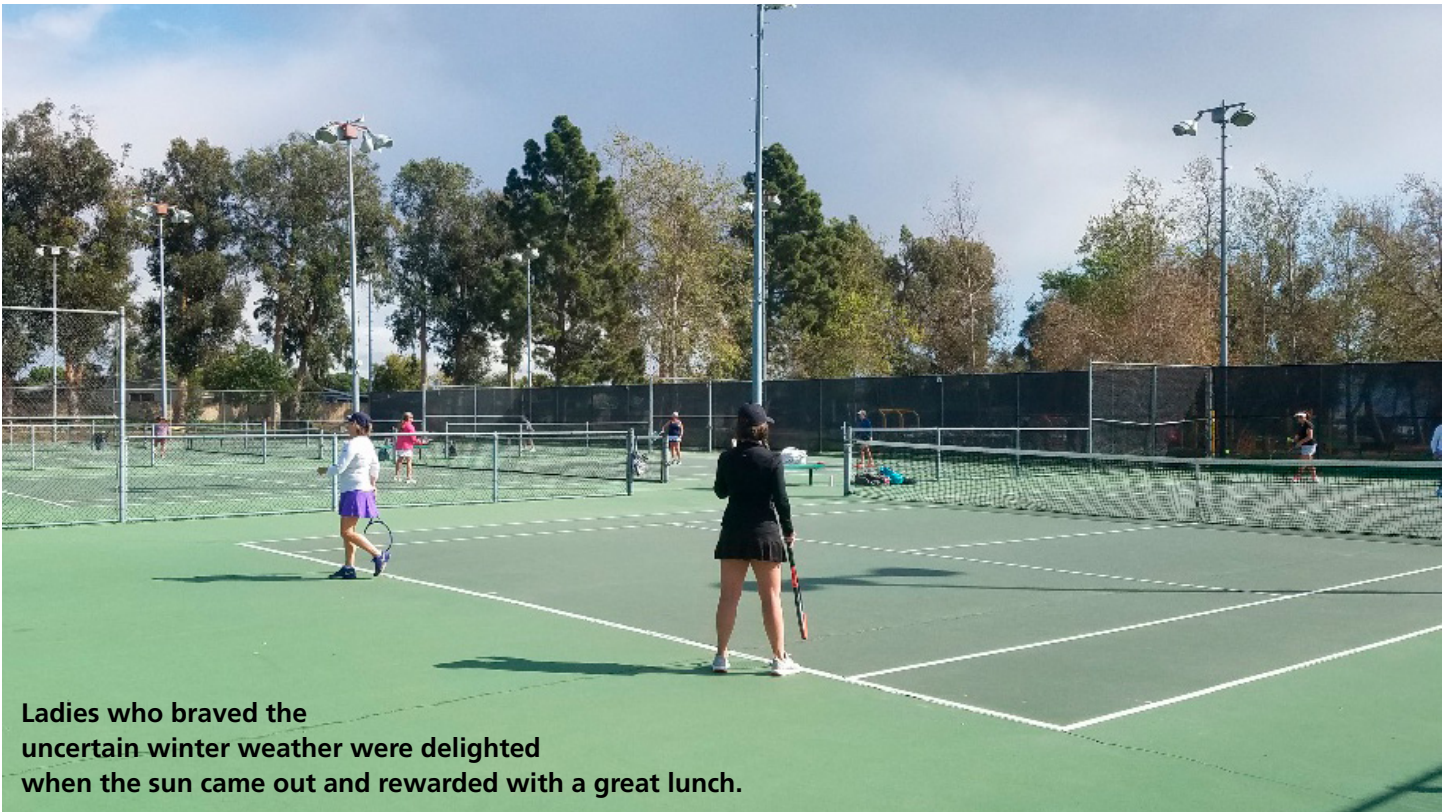
Ladies who braved the uncertain winter weather were delighted when the sun came out and rewarded with a great lunch.

Wells, Wimbledon and all USTA-sactioned leagues—as well as the closure of parks, recreational facilities, hiking trails, and beaches.