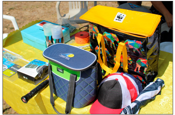
Hats and visors and other accessories with embroidered club logos are available for purchase.