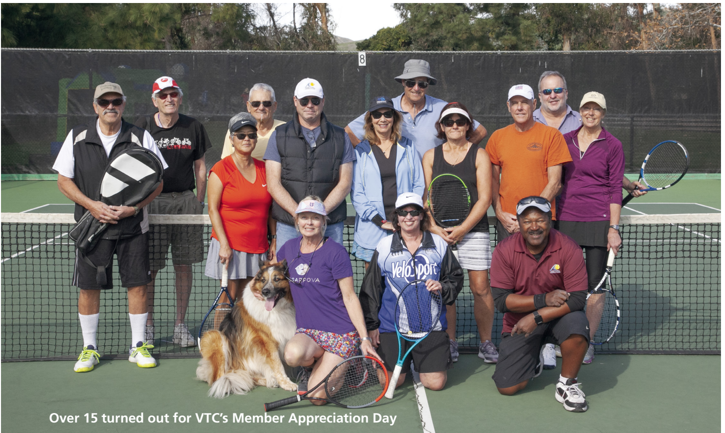
Over 15 turned out for VTC's Member Appreciation Day