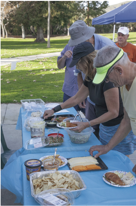
VTC Members Day lunch table