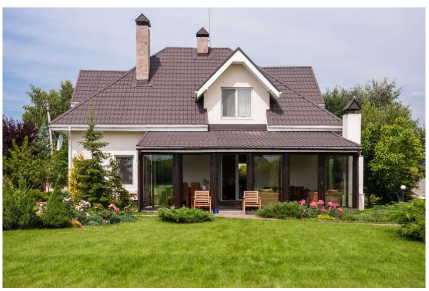
You can use a a pair of binoculars to look for: