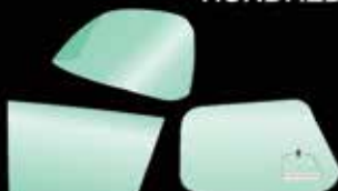
Windshields / Windows