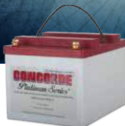
RG24-17 (24Volt/16 Ah)