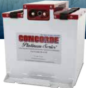
RG41/53 (24Volt/53 Ah)