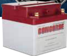
RG24-11M (24Volt/11 Ah)

NEW! A higher capacity battery, RG-41/53, is now available for M500 and M600 using STC SA01050DE.