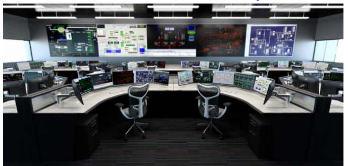
Command and Control Rooms