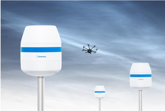
Counter UAV (Anti-Drone)