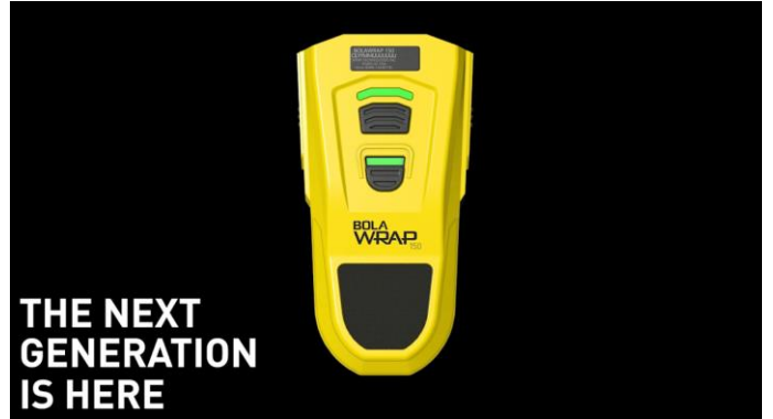
Remote Restraint Device