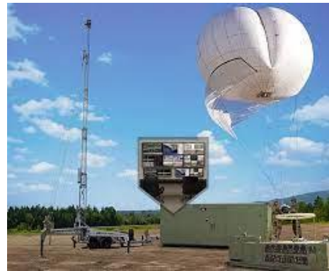
Persistent Surveillance System