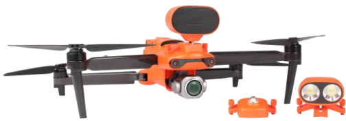
Military and Enterprise Drones