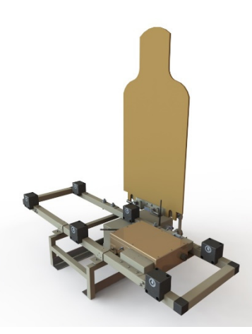
Optional LOMAH Module