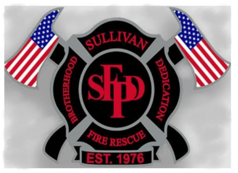
Newsletter May 2024