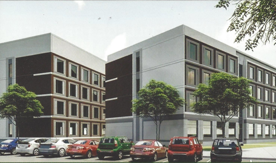
NEW FRESHMAN RESIDENCE HALLS- THE TOWERS