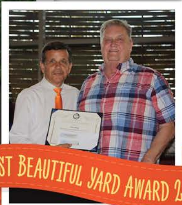
MOST BEAUTIFUL YARD AWARD 2015