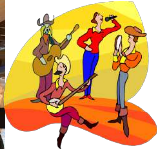
Peanut at one of their shows