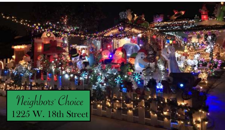
Neighbors' Choice 1225 W. 18th Street