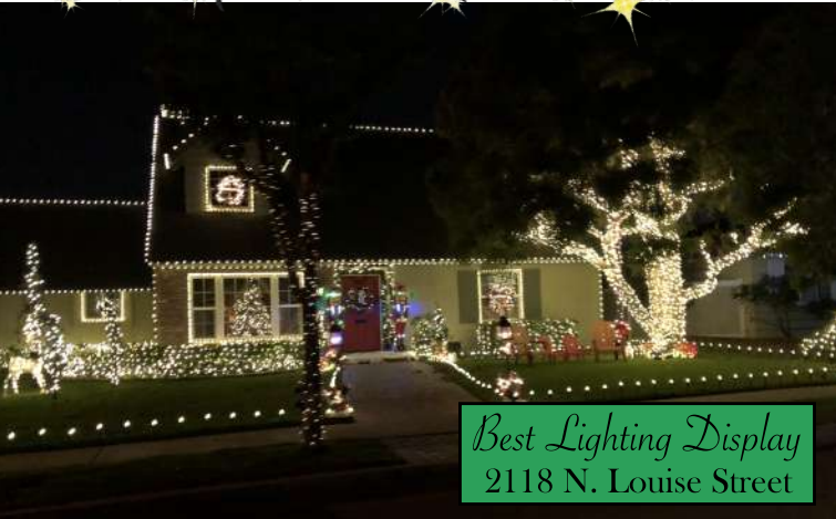
Best Lighting Display 2118 N. Louise Street