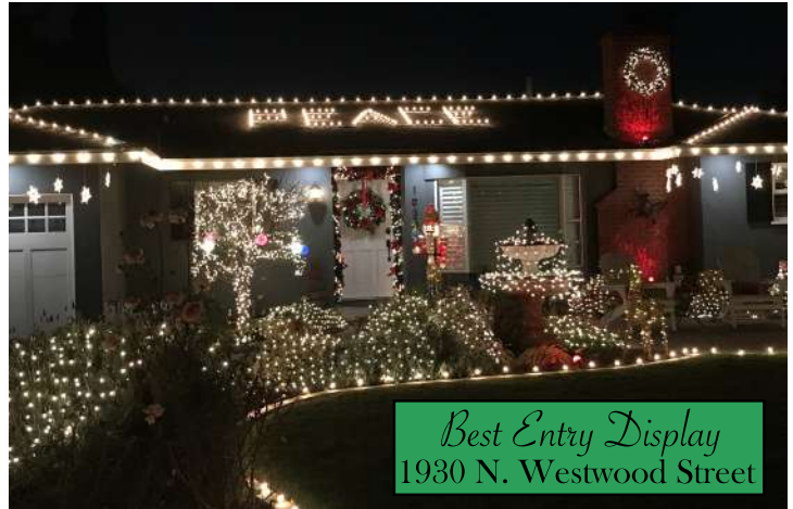
Best Entry Display 1930 N. Westwood Street