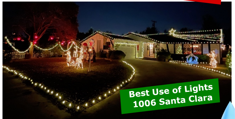
Best Use of Lights 1006 Santa Clara