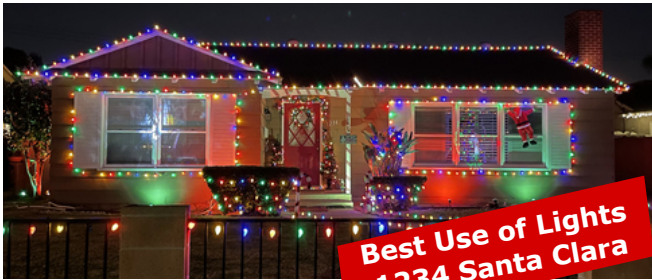
Best Use of Lights 1234 Santa Clara