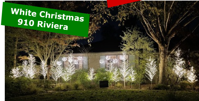
White Christmas 910 Riviera