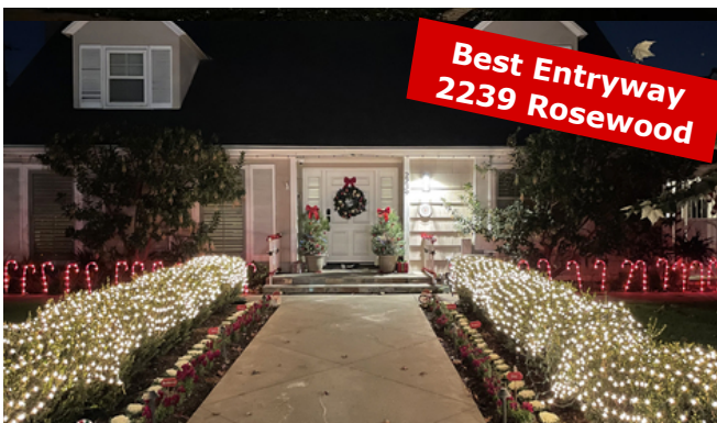
Best Entryway 2239 Rosewood