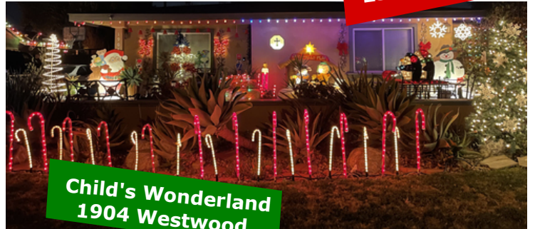
Child's Wonderland 1904 Westwood