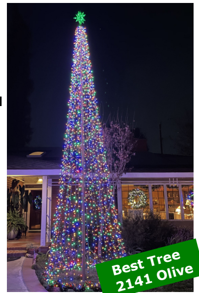
Best Tree 2141 Olive

On Saturday, December 19, Santa and Mrs. Claus visited West Floral Park to distribute the awards and yard signs to our holiday lighting contest winners. Congrats to all the winners and a big thank you to everyone who put up lights this year and made the neighborhood more festive than ever! (More pictures from the Kringles' visit can be found on our website)