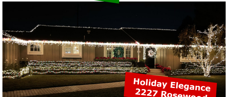
Holiday Elegance 2227 Rosewood