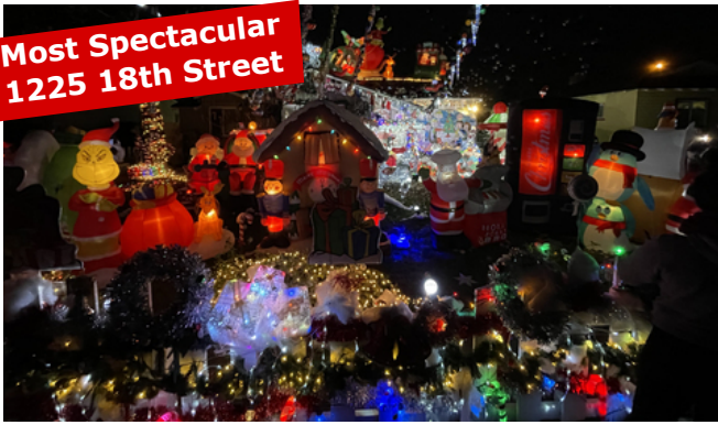
Most Spectacular 1225 18th Street