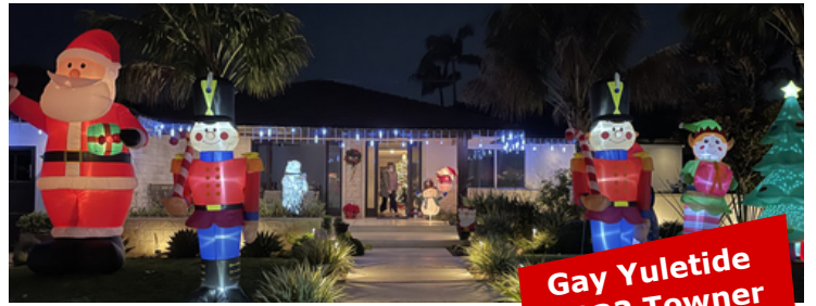
Gay Yuletide 2332 Towner