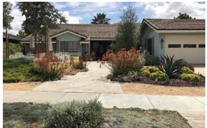
Home of Jimmy McGraw & Denise Belland at 2327 Towner Street