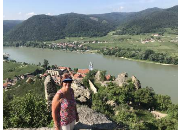
Durnstein, Austria, river cruise on the Danube

Through this pandemic and beyond, I strongly recommend that everyone find a travel advisor to trust with your travels. With our ever-evolving world of travel, using a professional will make for a smoother and easier vacation for you!