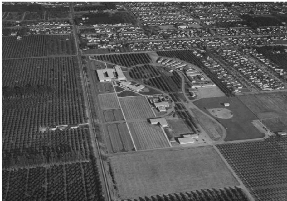
Aerial View of Santa College among the original orange groves (17th St. running top to bottom and Bristol running left to right)

Santa Ana College held its first classes in the fall of 1915 as Santa Ana Junior College, located on the campus of Santa Ana High School, during the presidency of Woodrow Wilson. It opened its doors to 24 students and 11 teaching faculty. It was the second junior college founded in Orange County and the fourth oldest in all of California. It relocated to its current location at 17th and Bristol in 1947 and now serves nearly 30 thousand students per semester!