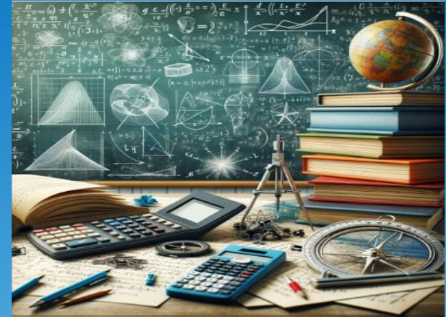
Advanced Algebra using Python