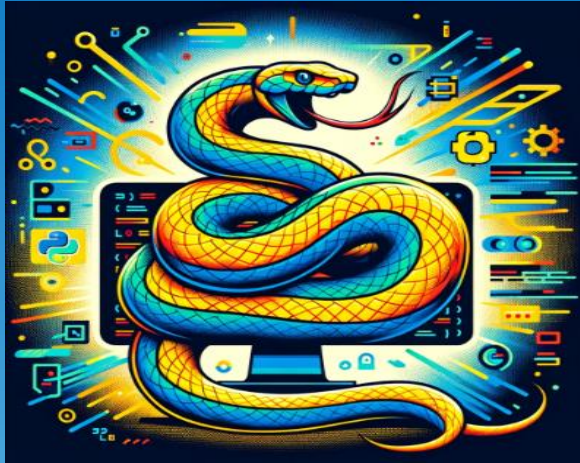
Basic & Advanced Python