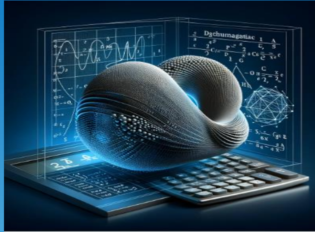
Calculus using Python