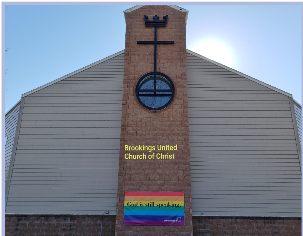
Brookings United Church of Christ