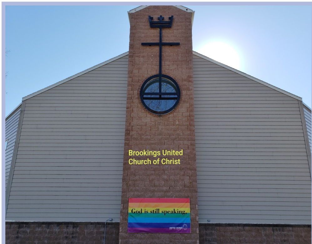
Brookings United Church of Christ