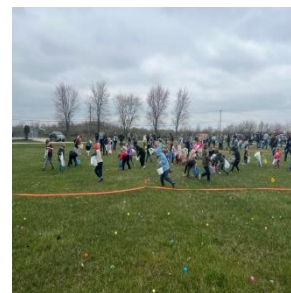
Having fun hunting.