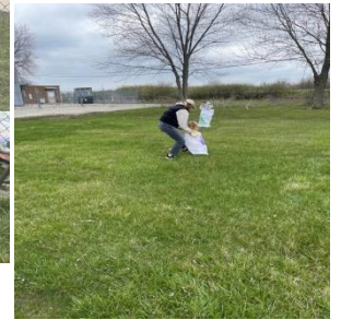
Lynnsey helping with potato bag race.