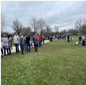
Children lined up waiting their turn for getting those eggs.