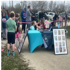
Children lined up for face painting. Thank you Enchanted Expressions