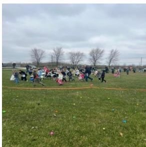
The HUNT begins!