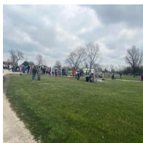
Getting a bunch.