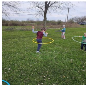
Children in the hula hoop challenge.