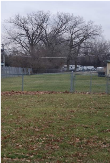
East of Office /hall/bar