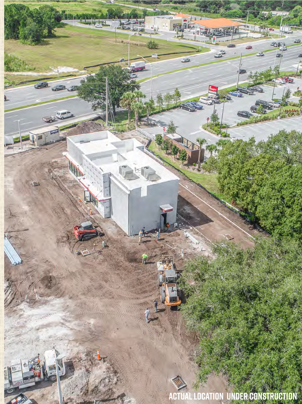
ACTUAL LOCATION UNDER CONSTRUCTION