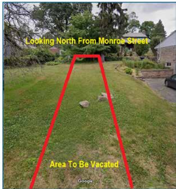
Looking North from Monroe Street