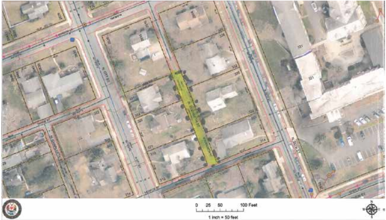
Aerial image provided by the City of Allentown Submitted with the Street Vacation Petition from the City of Allentown