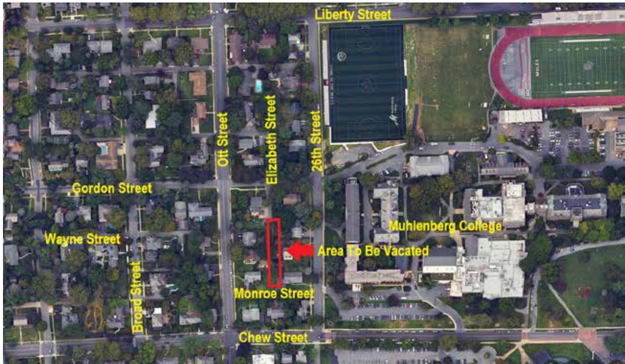
Aerial view of the North Elizabeth Street location, petitioned to be vacated, is in red box