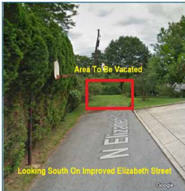
Looking south from North Elizabeth Street