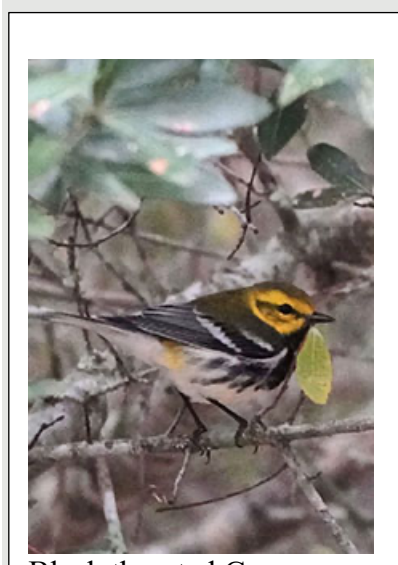
Black throated Green Warbler