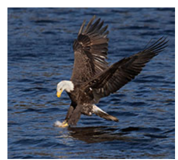
Bald Eagle Catch