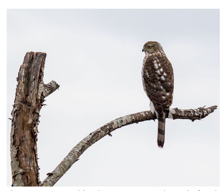
Coopers Hawk (juvenile female perhaps)

You already know there are many beautiful birds and other interesting creatures right here in Marion County, but many of our friends and neighbors have not yet noticed. There's now a new group where you can share any wildlife photos you've taken in Marion County. This group is intended to provide a window for residents to see the beauty in their own backyards and inspire them to go outside and see it for themselves. Join the page to add photos or just enjoy seeing what others share. Find it on Facebook- "Marion County Birds & Wildlife" and share with your friends. Adding one to two photos per post seems to work best. Feel free to post as often as you'd like.