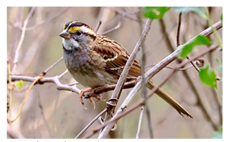
White Throated Sparrow

We hope that you'll join us during the next Halpata outing.