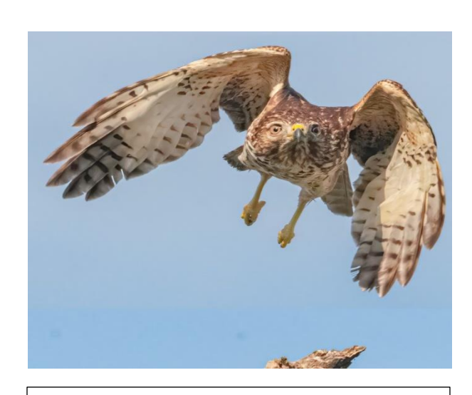
Photo left is a Barred Owl taken at Fort King and above is a red-shouldered Hawk at the Ocala Wetlands.