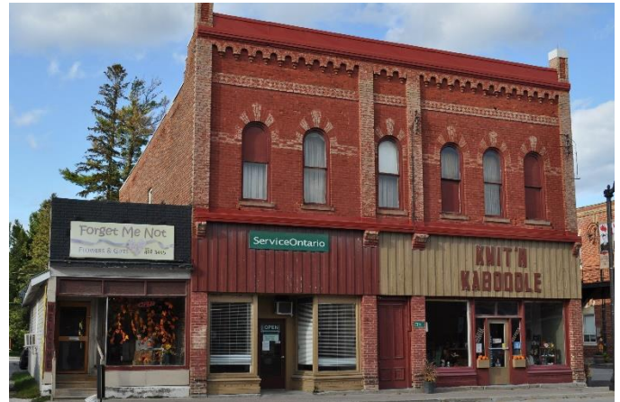
Figure 1 The Pearson Block 2019 1

The Pearson Block was built in 1884 along with other red brick buildings on the Main Street with brick from the Stayner Brick Yard which was at the eastern end of Town.