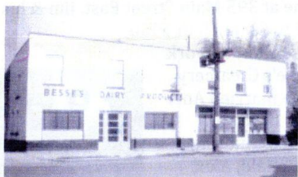
Besse's Dairy, Main St., Stayner, Ontario.