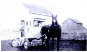
The evolution of milk delivery.

Reuben Besse purchased a Creamery from the Campbell family; the building he purchased is still at the same location on Main Street today. The Campbell's had purchased this building which had been a movie theatre, and started a creamery. Reuben rebuilt the building, and added the dairy in 1935. The dairy was equipped