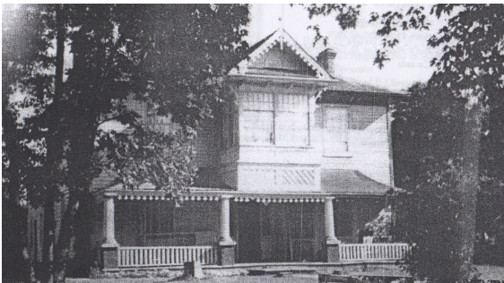
The Maguire House – where Tim Horton's now stands.