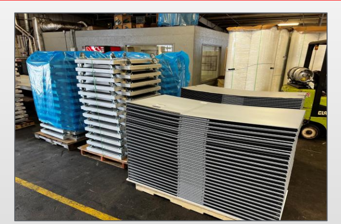
Sidewalls & cart bases stack up for storage. This is 100 carts!