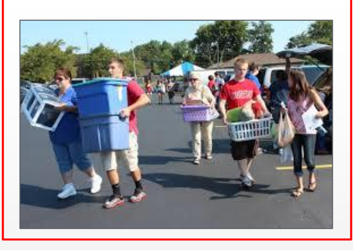
Don't wear parents out on move-in day...