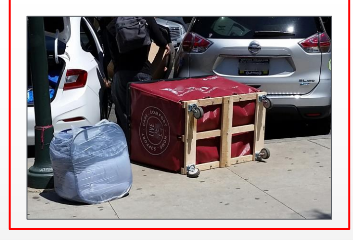
Don't use carts that can tip over...