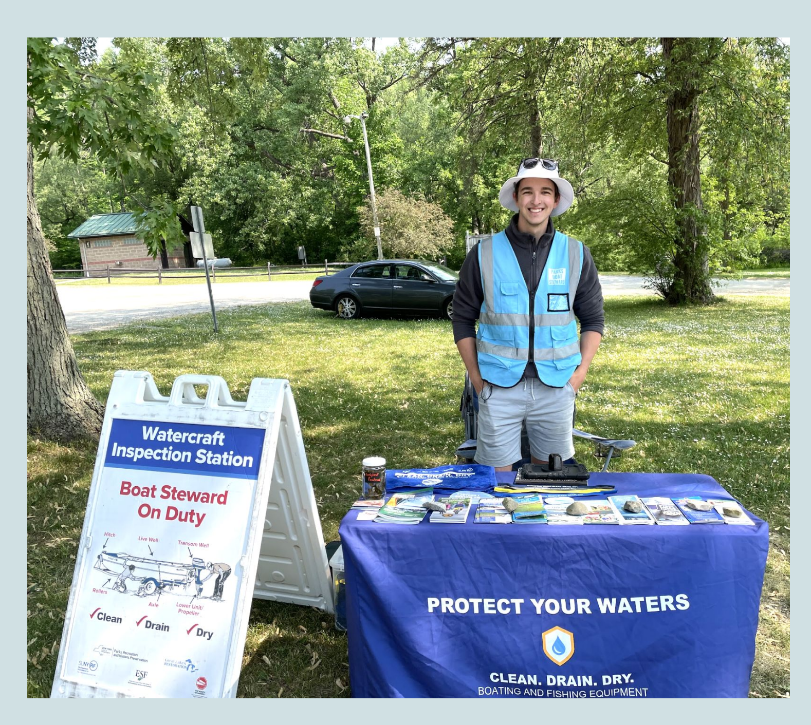
2023 steward Will ready for action!