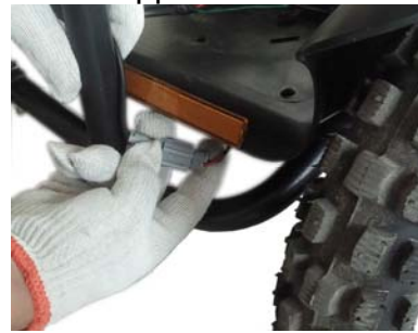
the lower rear frame