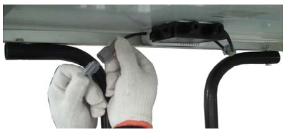
the upper rear frame