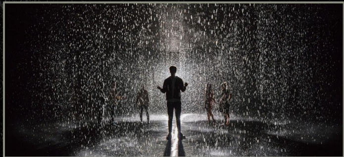
RAIN ROOM STUDIO LOCATION