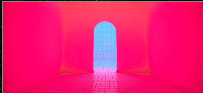
BRIGHT COLOR CONTROLLED CLEAN STUDIO LOCATION