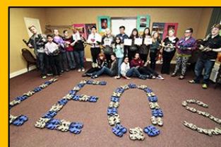
LEOS working on the project