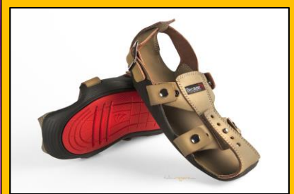
The Shoe That Grows