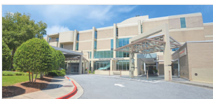
Northside Hospital offering tumor-imaging tool