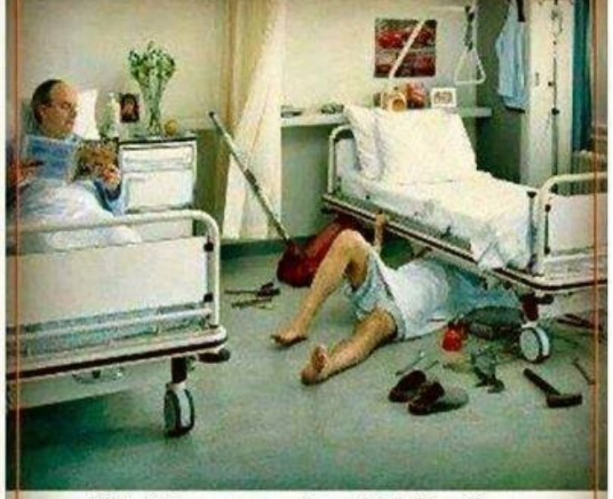
What happens when Old Car Guys get sent to the Nursing Home