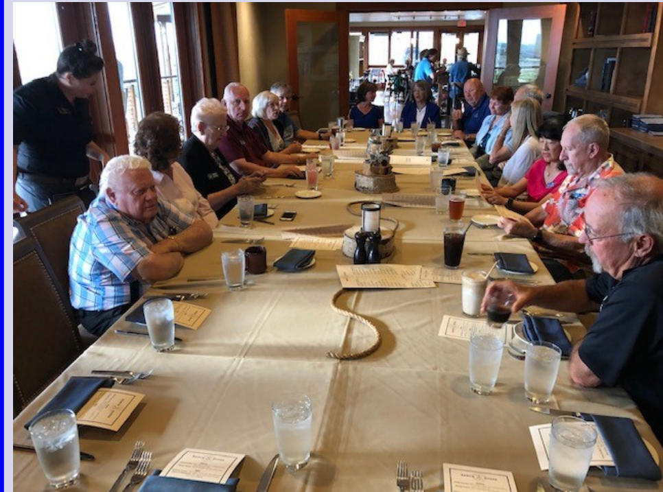
Social Night At Brasada