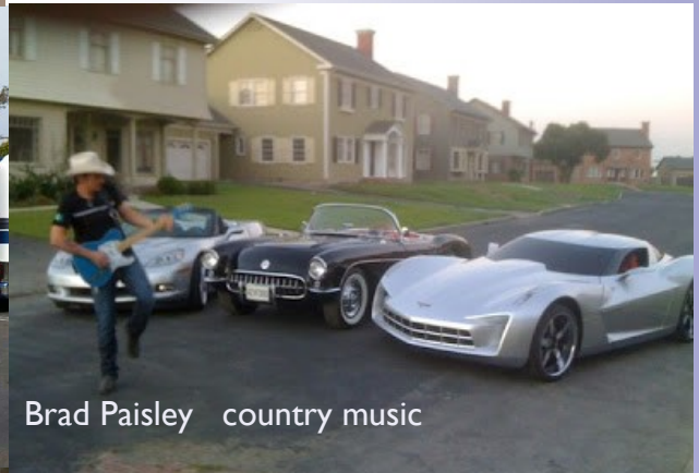
Brad Paisley country music