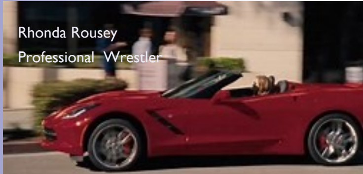
Rhonda Rousey Professional Wrestler