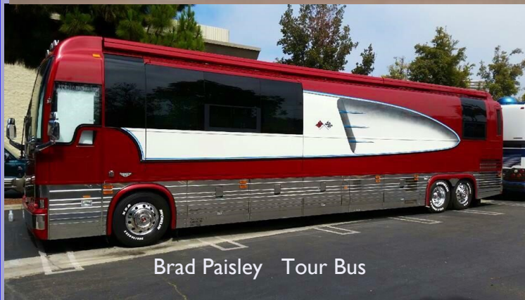
Brad Paisley Tour Bus