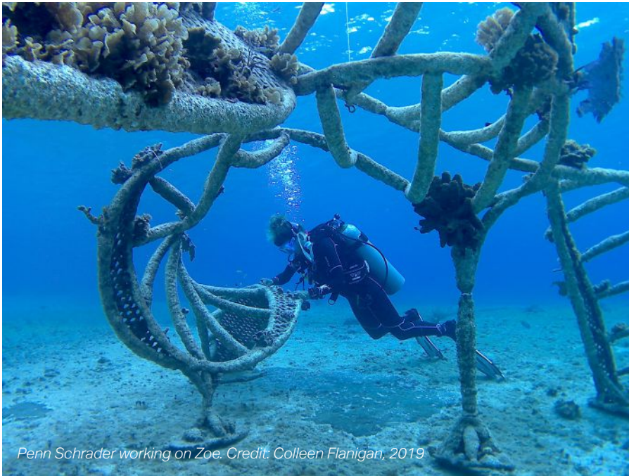
Penn Schrader working on Zoe.

For the past three and half years, Zoe - A Living Sea Sculpture has been anchored to the seafloor in Cozumel, Mexico. The DNA-inspired steel form is accreting limestone minerals through electrolysis to provide a fortifying marine substrate for corals to cement to and colonize. Corals build large natural reefs over thousands of years by secreting calcium carbonate, and with the urgency of the crisis facing coral reefs, this novel restoration method aims to give them a life-supporting pH boost and structural habitat, helping them adapt to environmental stressors such as climate change, ocean acidification, pollution, unsustainable fishing and development.