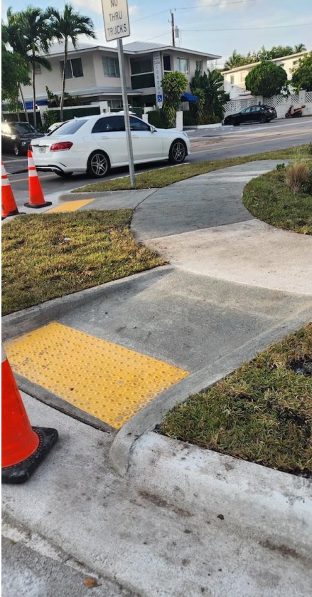
ADA compliant sidewalk