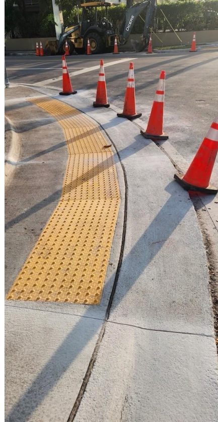
ADA compliant sidewalk

When the project is finished we will have sidewalks and crosswalks on all corners and a raised intersection to calm traffic