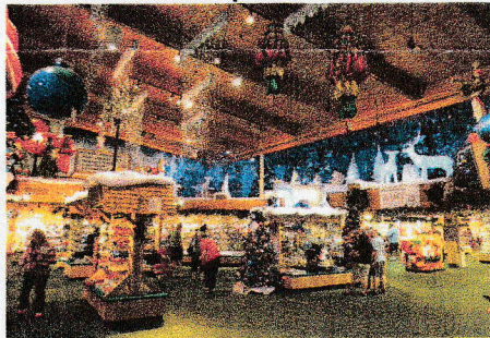
Bronner's Christmas Wonderland