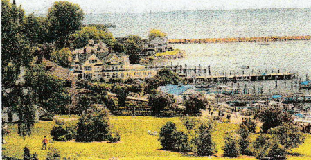
Picturesque Mackinac Island