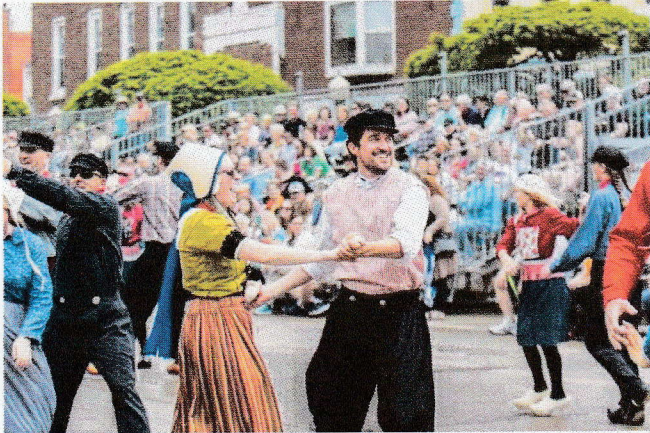
May 2-3 Pella Tulip Time